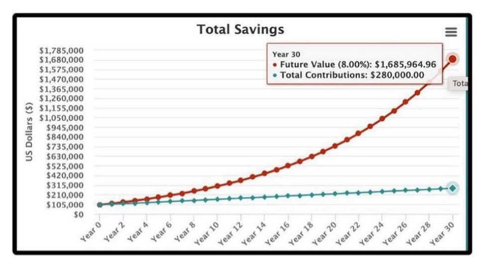
What an 8% average return looks like on a compound interest calculator: